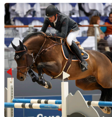
Uricas vd Kattevennen