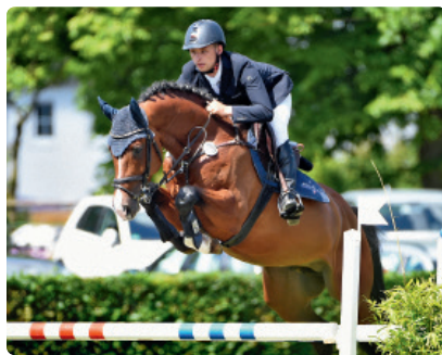
Dinken under Jonas Panje

Raised by the Holsteiner Verband, he was presented for pre-selection in August 2019 where he put up a performance befitting a modern, typical Holsteiner produce. Boasting long lines and a very good top-line, the stallion displays perfectly rhythmic and very ground-covering movement, always with an up-hill tendency. He jumps with tremendous ability, excellent front leg technique and energetic push-off.