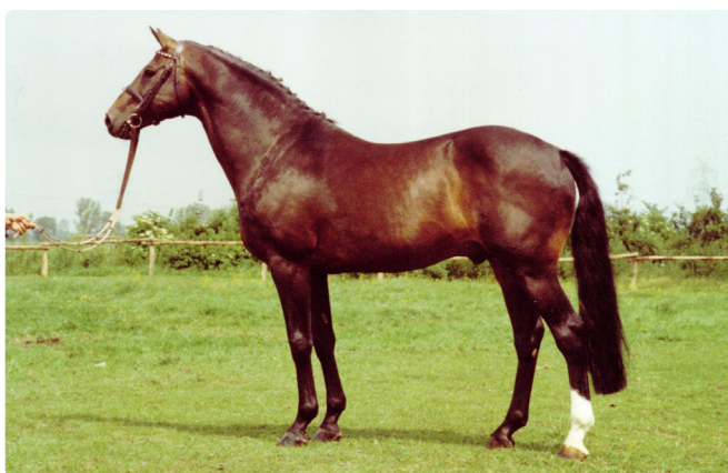
Cor de la Bryère