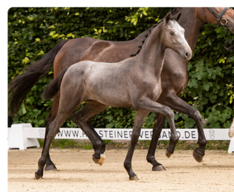
Foal by Crack-Cassini II

Two sons from his first foal crops have been stallion graded, Crackeur (out of a Cassini II-Lombard dam) and Call me Crack (out of a Carvall-Caretino dam). At the elite riding horse auction held in autumn 2023, a Crack daughter, Nilla, was knocked down to an international sport stable at 35,000 euros.