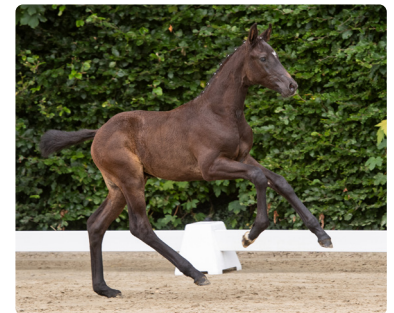
Foal by Chezarro-Carvallo