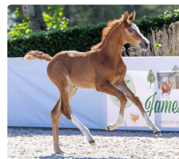
Filly by Vigado-Casall

The young Vigado sons and daughters also met with a lot of interest at the Holsteiner foal auction. One of them, Very Nice (out of a Casall dam) was knocked down to US American clients at the 2023 Hörup foal auction for 17,000 euros.