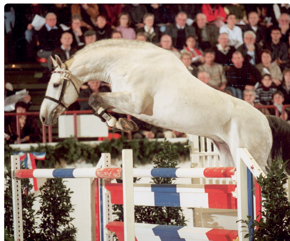
Cassini II at free jumping

Cassini II was never shown in competition, even though his free jumping performances gave proof of his tremendous ability. Having made a name for himself for his very successful sport horse offspring. His son Monaco N.O.P. under Harrie Smolders is the most successful Holsteiner horse in international top sport. He jumped to fifth place in the 2022 WBFSH ranking with successes such as second place in the World Cup Final in Leipzig.