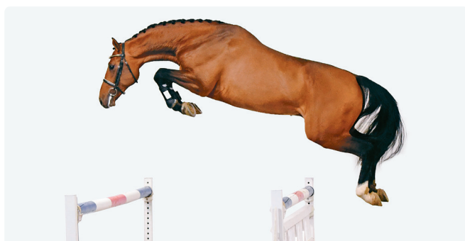
Corfu de la Vie at free jumping