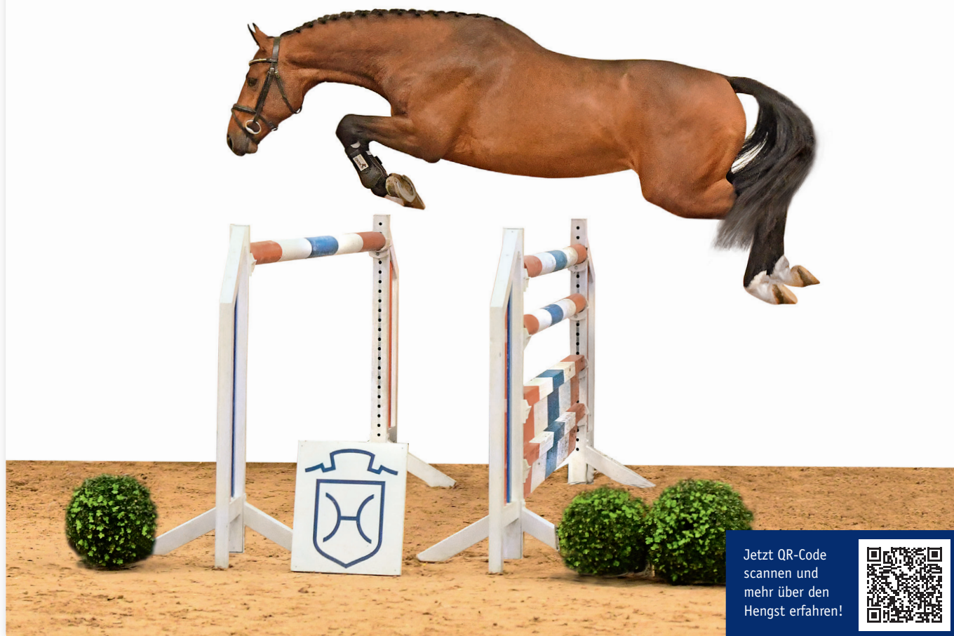
Zuccarello at free jumping