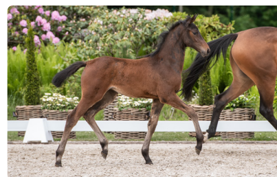
Filly by Cahil-Quibery

Four-year-old, he already won young horse jumping classes at A level. Having undergone a great development, physically as well as under saddle, the stallion collected placings in young horse jumping classes up to M level and won several jumper classes up to 1.30m with Lucas Wenz.