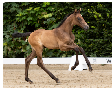
Foal by Corfu-Cascavelle