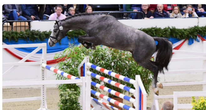
Champion stallion Cahil in Neumünster