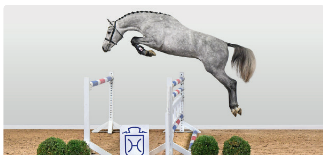
Crack at free jumping