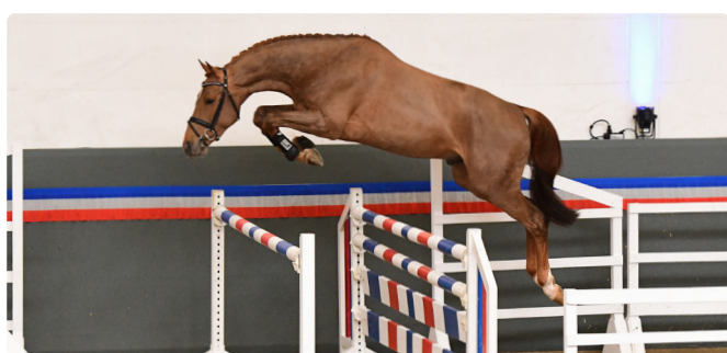
Vigado at free jumping