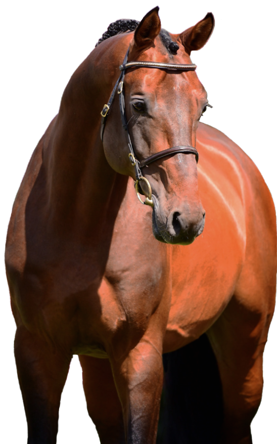
Corfu de la Vie