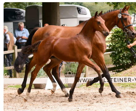
Colt by Charaktervoll-Cassini II

In January 2024, a Charaktervoll son has been licensed for breeding at the DSP stallion grading at Neustadt upon Dosse.