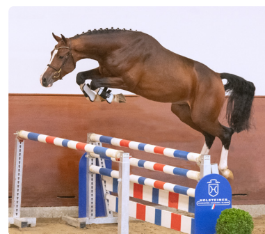
Kantato by Keaton-Casall