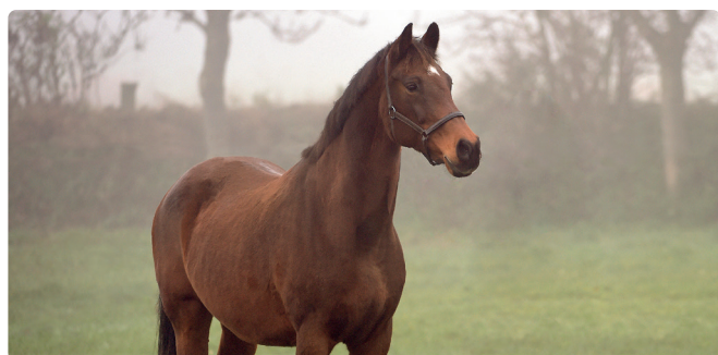
Casalls dam Kira XVII