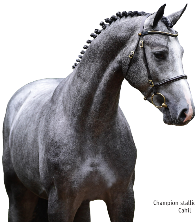
Champion stallion 2019: Cahil